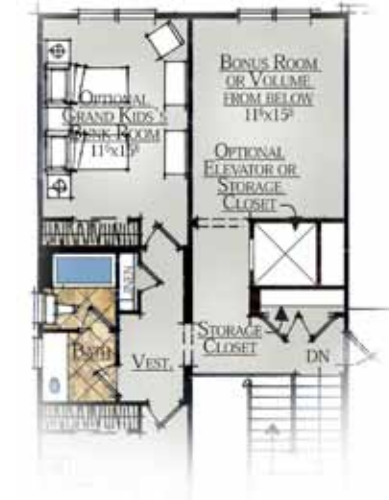
OPTIONAL GRAND KID'S BUNK ROOM