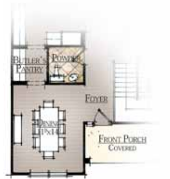
OPTIONAL DINING WITH BUTLER'S PANTRY