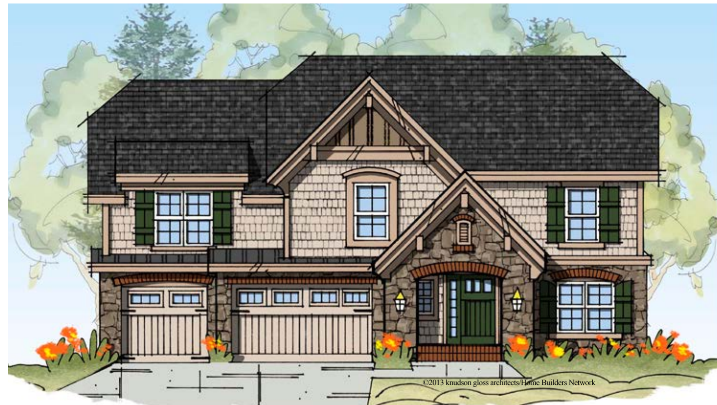
EURO-COTTAGE ELEVATION | 0' 4' 12' 3/32" = 1' - 0"