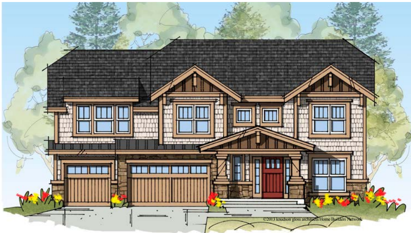
CRAFTSMAN ELEVATION | 0' 4' 12' 3/32" = 1' - 0"