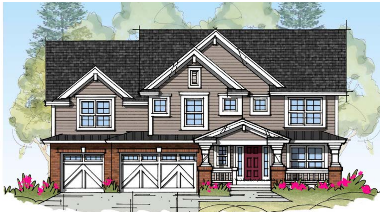
TRADITIONAL ELEVATION | 0' 4' 12' 3/32" = 1' - 0"