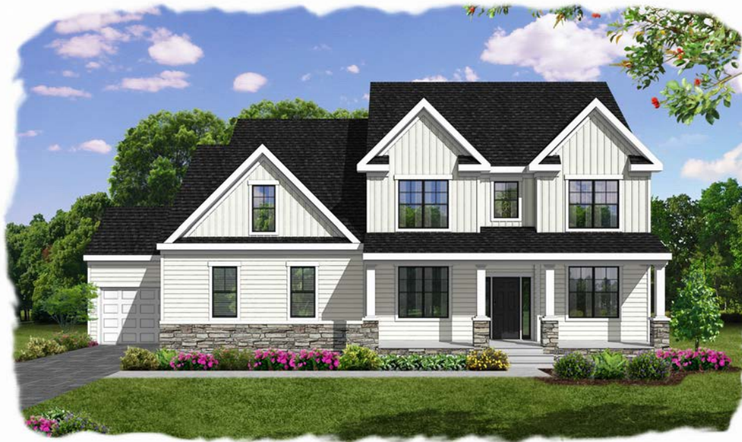
Modern Farmhouse Elevation